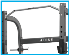
Chrome-plated, knurled, multi-position chin up bar