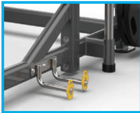
Available with optional band pegs